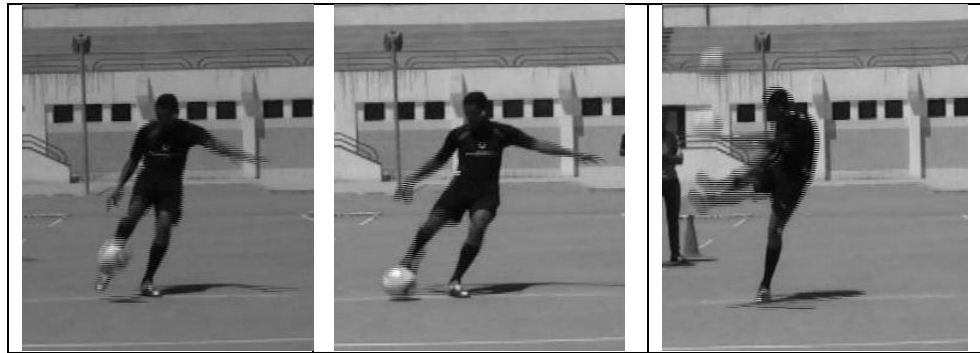
Figure (1) Methods of performing the three kicks (under research)