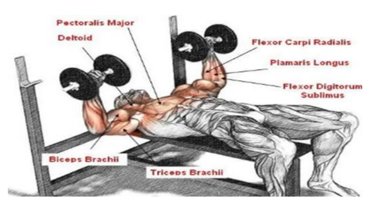
Figure (5). Muscles of dumbbell bench press exercise

Variations of the bench press involve different groups of muscles or involve the same muscles in different ways: The flat bench press involves both portions of the pectoralis major muscle but focuses on the lower (sternal) head as well as the anterior deltoid muscle. The