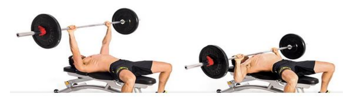
Figure (6). Flat Bench Press Exercise

term 'bench press' on its own is assumed to refer to a flat bench press. The flat bench press allows athlete to use his body weight as resistance, this is a good way to perfect your form and build up some strength while staying safe [34].