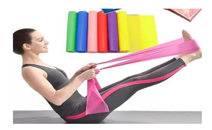
Figure (1). Thera-Band Resistance

Having large muscles also makes our bodies produce more testosterone. This means stronger bones, improved cardiovascular health, plus many other benefits. While there are many benefits to bench pressing, the best part is that it's easy to do. Anyone can learn how to bench press, regardless of age or fitness level. The key is to start out light and perfect the form before adding weight. The barbell bench press is one of the universal gauges of strength lifters use to establish the weight room hierarchy. The more plates you can pile onto each side of the barbell and successfully