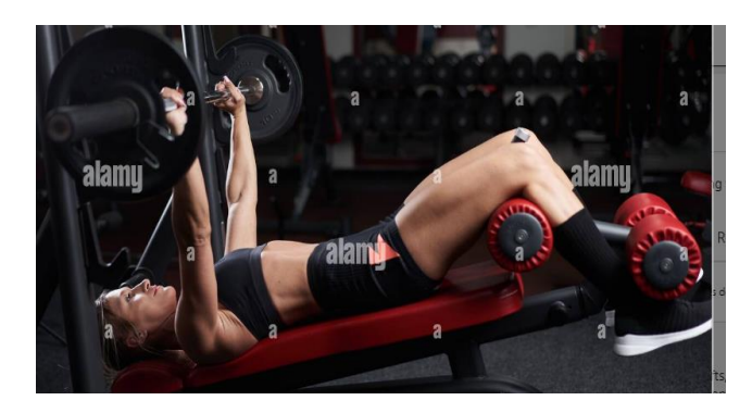
Figure (3). Inclined bench Press.

The comparison between a recreational and powerlifting bench press shows vast differences, maybe more so than the comparison between a weightlifting and powerlifting squat. The aims are very different (muscular hypertrophy, aesthetics, sports / everyday life performance compared to strength increase power output, weight lifted etc.). While bodybuilders / recreational lifters may want their muscles to be 'felt' working, powerlifters generally try to move the weight by manipulating joint positions and maximizing biomechanical advantages – reducing moment arms and keeping the weight close to the fulcrum [16].