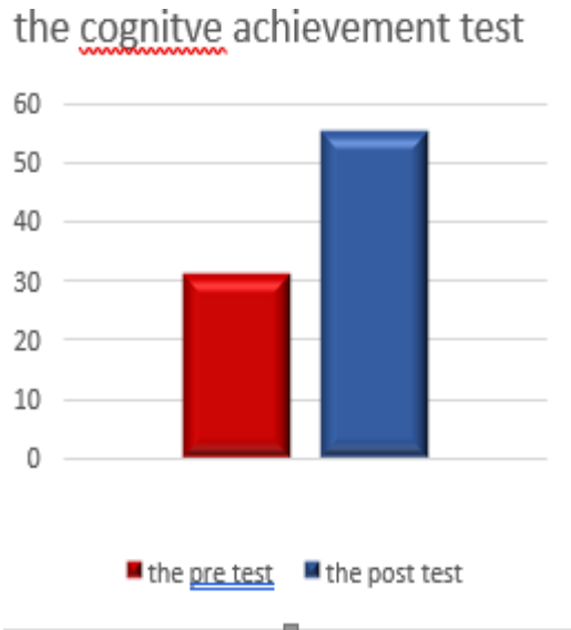
Table (2) The magnitude of the academic achievement test Percentage Improvement rate for the experimental group and the control group before and after the experiment according to Cohn's equations.